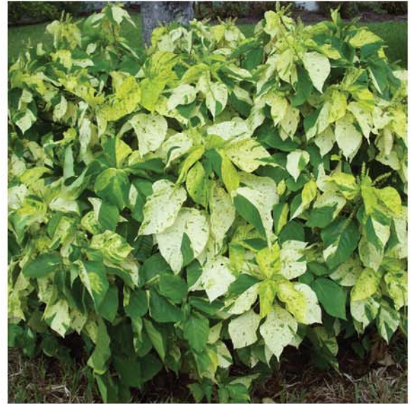
COPPERLEAF 'JAVA WHITE'