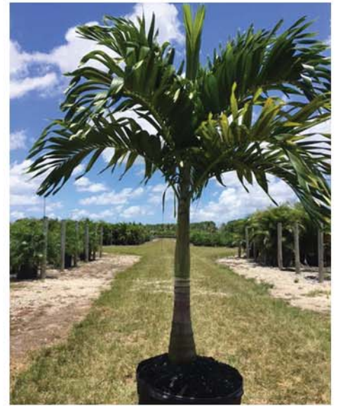
SINGLE ADONIDIA PALM