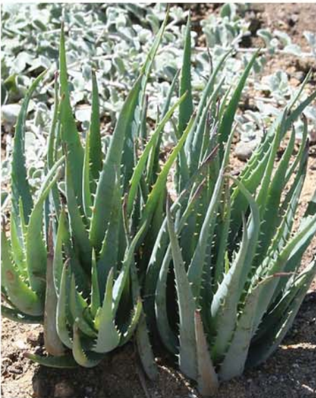
ALOE 'BLUE ELF'