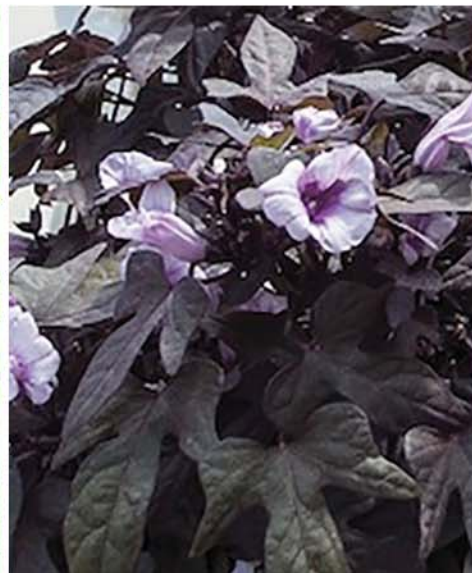
POTATO VINE 'BLACKIE'