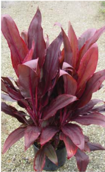
TI PLANT 'AUNTIE LOU'