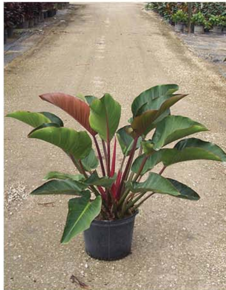
PHILODENDRON 'ROJO CONGO'