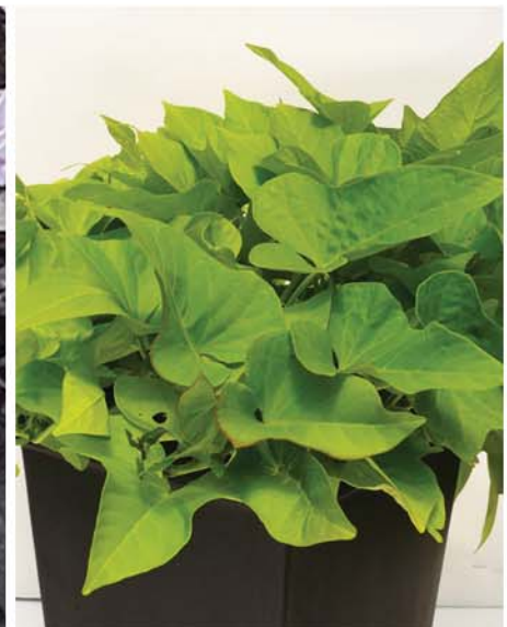
POTATO VINE 'LIME'