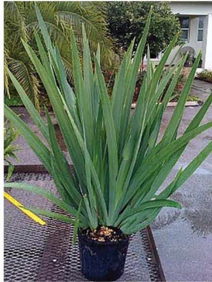
GIANT APOSTLE'S IRIS