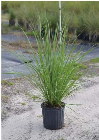
DWARF FAKAHATCHEE GRASS