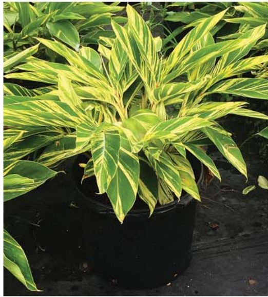
VARIEGATED SHELL GINGER