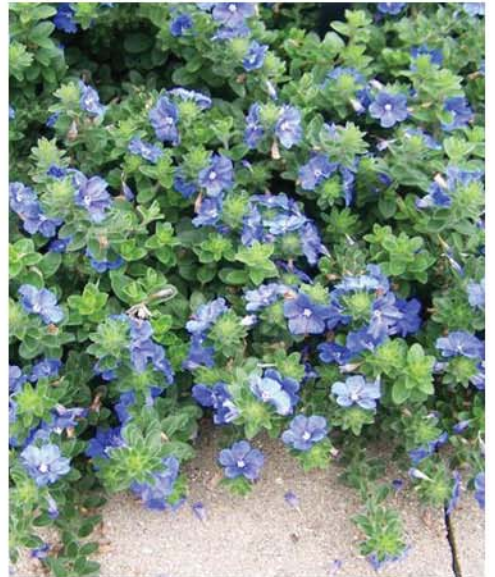
BLUE DAZE 'BLUE MY MIND'