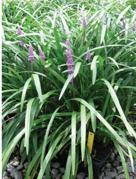
LIRIOPE 'BIG BLUE'