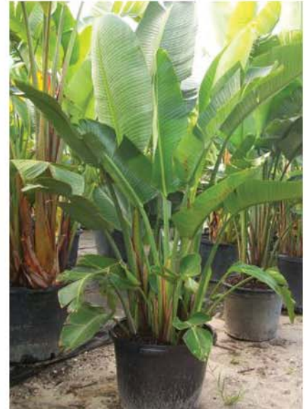
WHITE BIRD OF PARADISE