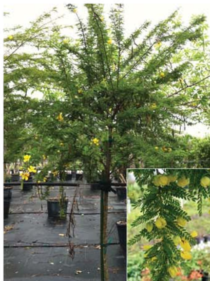
DESERT CASSIA TREE