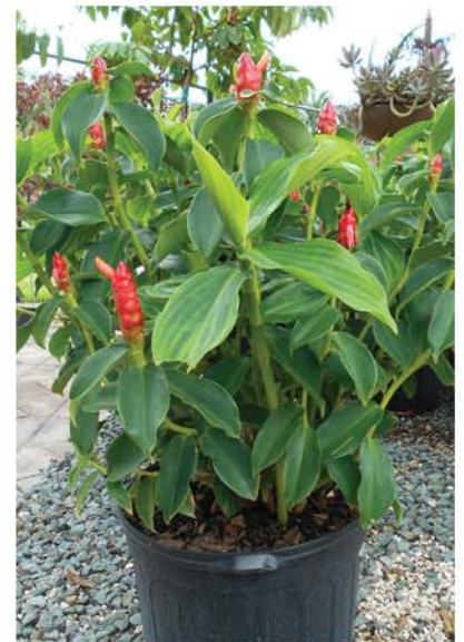
RED BUTTON GINGER