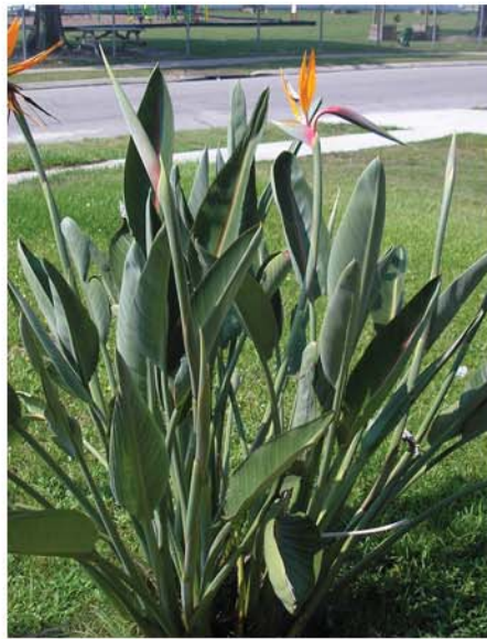
ORANGE BIRD OF PARADISE