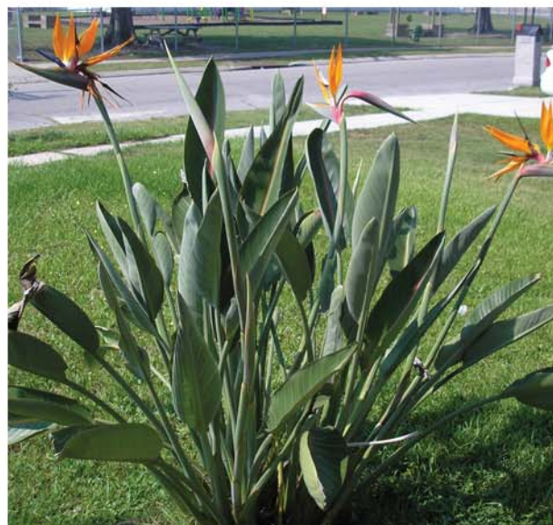
ORANGE BIRD OF PARADISE