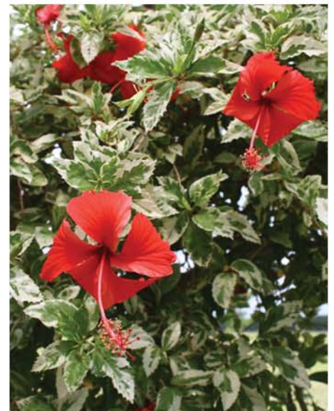
SNOW QUEEN HIBISCUS