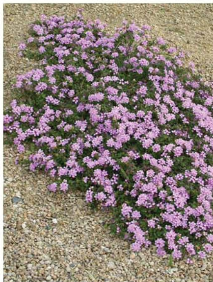
PURPLE TRAILING LANTANA