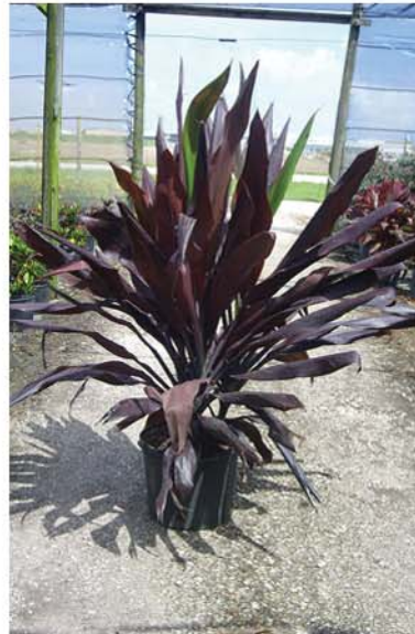
TI PLANT 'BLACK MAGIC'