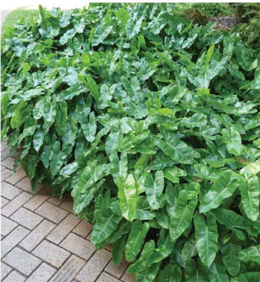
PHILODENDRON 'BURLE MARX'