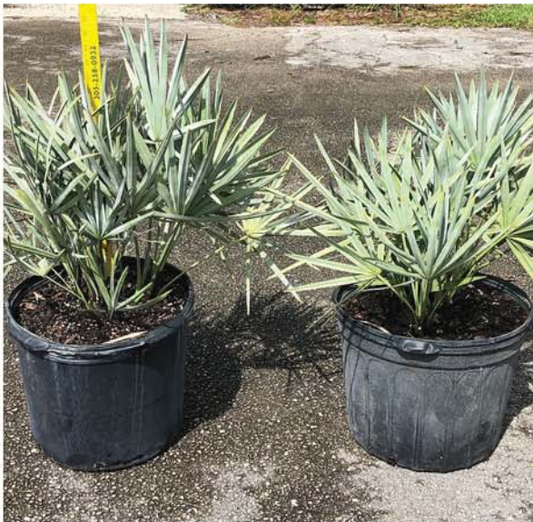
SILVER SAW PALMETTO