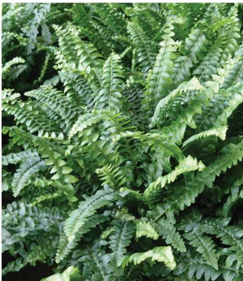
BOSTON FERN 'KIMBERLY QUEEN'