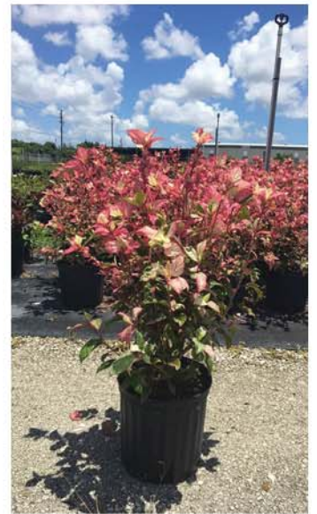
RED HOT HIBISCUS