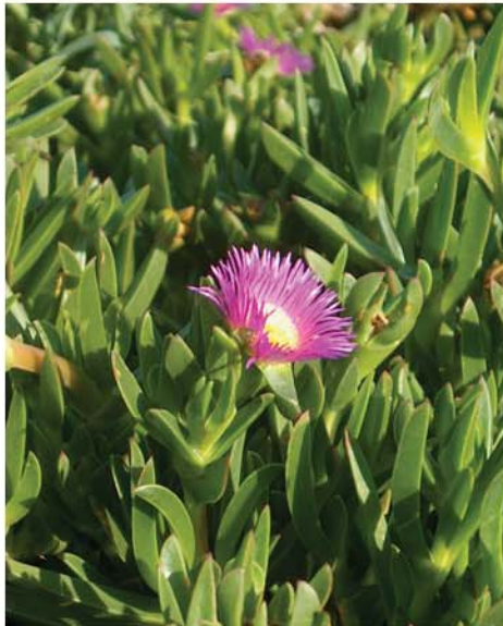
GIANT ICE PLANT